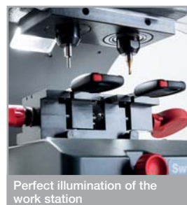
Perfect illumination of the work station