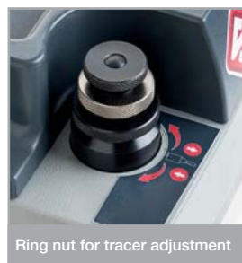
Ring nut for tracer adjustment