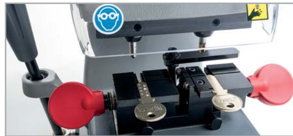
Cutting area optimized for a wide range of keys

The levers and knobs of the machine are made of engineering plastics and, thanks to their ergonomic shape, guarantee comfortable grip and handling. The carriage shifting via rods and bush-